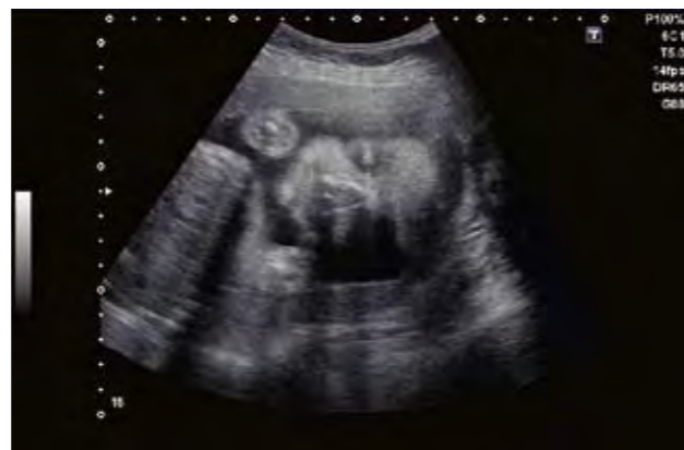
Third-trimester scan for confirmation of viability demonstrating the foetal face

Justification for on-site imaging is to make diagnoses to support valid transfers to a hospital and prevent unnecessary admissions to the busy on-take hospitals supporting the festival. The team of radiologists encouraged the FMS emergency doctors to request ultrasound investigations in the same fashion as they would do in their normal practice. There were twenty requests for ultrasound investigation and twelve scans performed. Many of the ultrasound requests were for pregnant patients with suspected miscarriage (Fig. 1) or third trimester patients (Fig. 2) with anxiety due to lack of recent foetal movement. The ability to image these patients for confirmation of foetal viability eased patient anxiety and prevented unnecessary transfer.