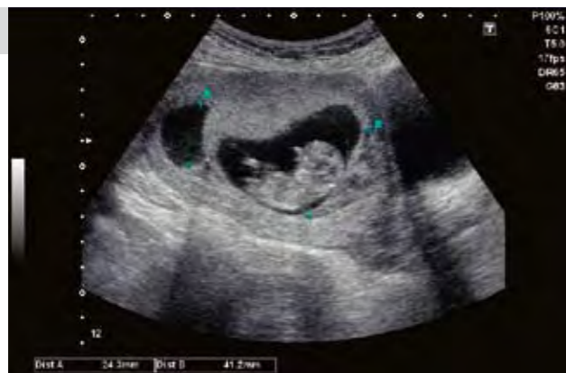
10-week live intrauterine pregnancy with an adjacent 24 mm subchorionic bleed