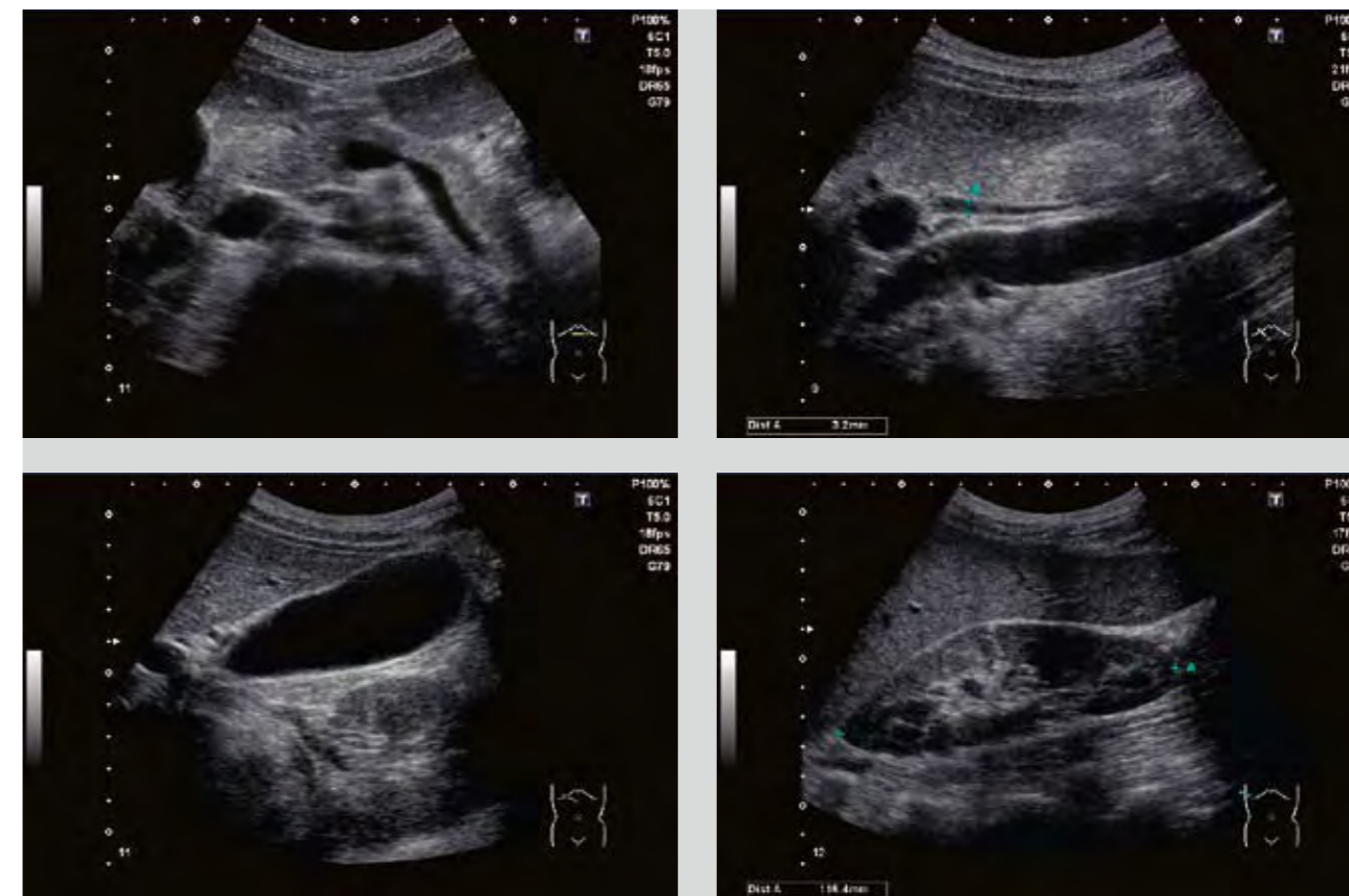
Ultrasound of the upper abdomen. Images show the usual suspects for RUQ pathology: pancreas, distal common bile duct, gall bladder and right kidney

In a typical fashion to many emergency department presentations, a 29 year old female attended with a 24 hour history of right upper quadrant pain. The ultrasound examination excluded renal obstruction and significant pathology which requires surgery. After urine analysis the patient was treated for right sided pyelonephritis. A different case of left flank pain demonstrated a localised large bowel wall thickening and probable diverticulitis.