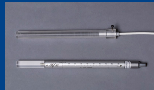
CT dosimetry with an ionization chamber and a solid state detector