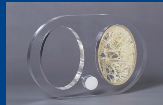
Lung phantom with 3D printed insert