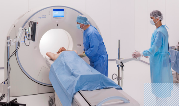
Toshiba's Aquilion ONE GENESIS